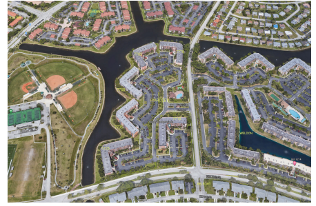
Built in 2004 - 360 units - 4 floors

Kings Point 7620 Nob Hill Road, Tamarac, FL 33321 Tel. (954)726-4120 http://kingspoint.com/