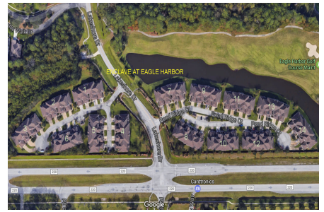
Built in 2007 - 88 units - 2 floors

The Enclave at Eagle Harbor Condominium Association, Inc Management Contact Information Address: 10175 Fortune Parkway, Suite 906, Jacksonville, FL 32256 Phone: (904) 223-7224 x 1503 email: dbelet@lelandmanagement.com https://eagleharboronline.com/NeighborhoodPage.php?IMenuID=82