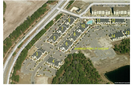
Built in 2007 - 192 units - 2 floors

Signature Realty & Management 4003 Hartley Rd Jacksonville, FL 32257 (904) 268-0035 https://www.srmiproperties.com/