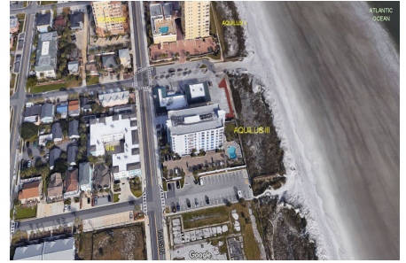
Built in 2011 - 14 units - 4 floors

Acquillus 3 Condo Association Address: 807 1st St N, Jacksonville Beach, FL 32250 Phone: +1 904-249-4396