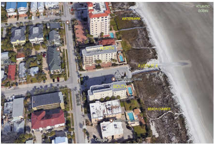
Built in 2005 - 8 units - 5 floors