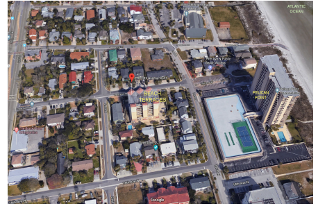
Built in 2005 - 18 units - 7 floors

BEACH TERRACES CONDOMINIUM ASSOCIATION, INC. C/O SENTRY MANAGEMENT 2180 WEST SR 434 SUITE 5000 LONGWOOD, FL 32779