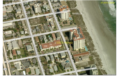
Built in 2006 - 100 units - 13 floors

Costa Verano Front Desk 904 247 0001 http://costaverano.org/