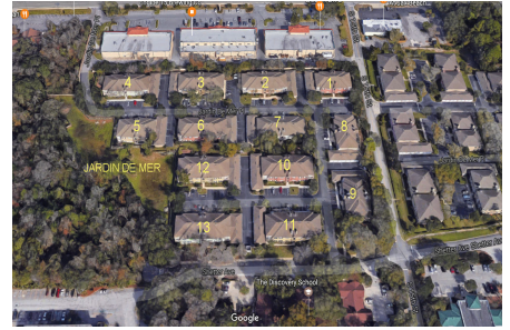
Built in 2004 - 175 units - 2 floors