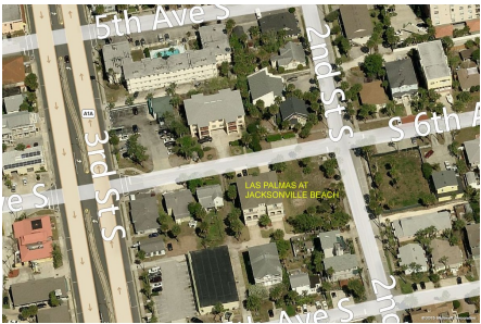
Built in 2004 - 4 units - 3 floors