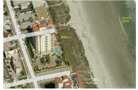
Built in 2005 - 22 units - 12 floors

MARBELLA OWNERS ASSOCIATION, INC. SENTRY MANAGEMENT INC 2180 W STATE SR 434 STE 5000 ONGWOOD FL 32779