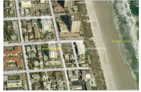
Built in 2006 - 35 units - 8 floors

NorthShore Management Company First Coast Association Management, LLC 11555 Central Parkway, Suite #801 Jacksonville, Florida 32224 (904) 998-5365 ext 223 (904) 998-5366 fax http://www.northshore32250.com/