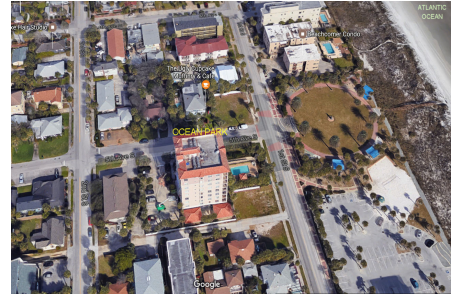
Built in 2007 - 17 units - 9 floors

Number of units: 17 Number of active listings for rent: 0 Number of active listings for sale: 0 Building inventory for sale: Number of sales over the last 12 months: 0%% Number of sales over the last 6 months: 1 Number of sales over the last 3 months: 0