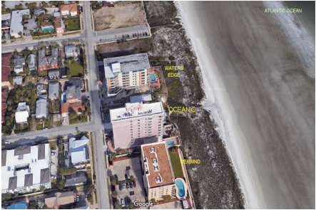
Built in 2003 - 10 units - 11 floors