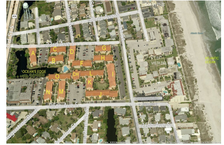
Built in 2006 - 181 units - 3 floors

OCEANS EDGE CONDOMINIUM ASSOCIATION INC VISTA COMMUNITY ASSOCIATION MANAGMENT PHONE 407-682-3443 904-247-9052 http://www.oceansedgeliving.com/index.php