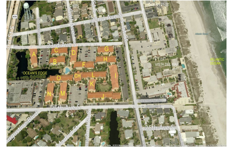
Built in 2006 - 181 units - 3 floors

OCEANS EDGE CONDOMINIUM ASSOCIATION INC VISTA COMMUNITY ASSOCIATION MANAGMENT PHONE 407-682-3443 904-247-9052 http://www.oceansedgeliving.com/index.php