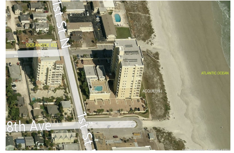
Built in 2007 - 25 units - 10 floors

Management office location: 1825-A North Third Street, Jacksonville Beach, FL 32250 Telephone 904-249-8599 ext 228 Fax 904-249-8598