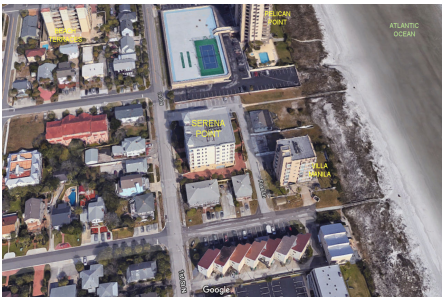
Built in 2006 - 17 units - 7 floors

Serena Point Condo Association 1809 1st St N, Jacksonville Beach, FL 32250 (904) 246-4370