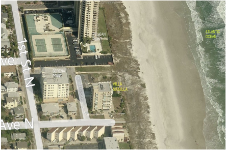
Built in 1984 - 11 units - 7 floors

Number of units: 11 Number of active listings for rent: 0 Number of active listings for sale: 0 Building inventory for sale: Number of sales over the last 12 months: 0% Number of sales over the last 6 months: 0 Number of sales over the last 3 months: 0 Villa Manila Condominium Association Inc 5 17th Avenue North Apartment 402 Jacksonville Beach, FL 32250 Phone: (904) 246-5140