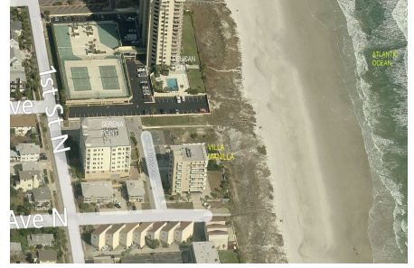
Built in 1984 - 11 units - 7 floors

Villa Manila Condominium Association Inc 5 17th Avenue North Apartment 402 Jacksonville Beach, FL 32250 Phone: (904) 246-5140