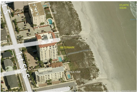
Built in 2005 - 25 units - 11 floors

THE WATERMARK CONDOMINIUM ASSOCIATION OF JACKSONVILLE BEACH, INC. LA VILLA MANAGEMENT INC. 219 CRANES LAKE DR PONTE VEDRA BEACH FL 32082 904-285-8316