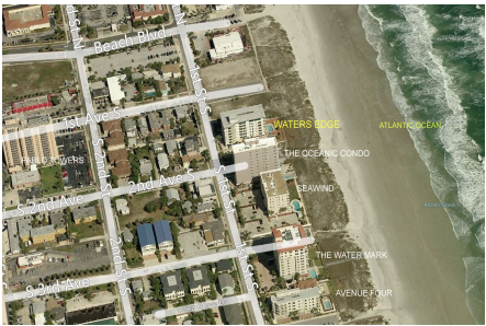
Built in 2006 - 16 units - 7 floors

Water's Edge Luxury Oceanfront Condominiums 212 3rd Avenue South Jacksonville Beach, FL 32250