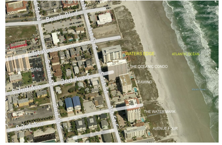
Built in 2006 - 16 units - 7 floors

Water's Edge Luxury Oceanfront Condominiums 212 3rd Avenue South Jacksonville Beach, FL 32250