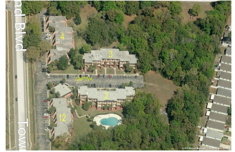
Built in 1974 - 64 units - 3 floors

CAPTIVA CONDOMINIUM ASSOCIATION, INC. LELAND MANAGEMENT INC PHONE 407-447-9955 FAX 407-447-9899