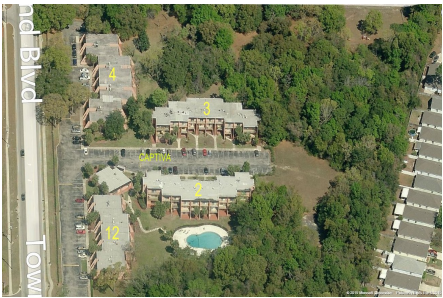
Built in 1974 - 64 units - 3 floors

CAPTIVA CONDOMINIUM ASSOCIATION, INC. LELAND MANAGEMENT INC PHONE 407-447-9955 FAX 407-447-9899