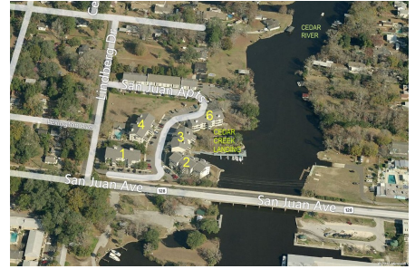
Built in 1987 - 60 units - 3 floors

Number of units: 60 Number of active listings for rent: 1 Number of active listings for sale: 0 Building inventory for sale: Number of sales over the last 12 months: 6% Number of sales over the last 6 months: 0 Number of sales over the last 3 months: 0