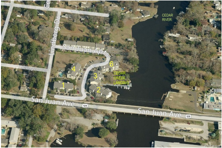
Built in 1987 - 60 units - 3 floors

Cedar Creek Landing Condominium Association Address 5615 San Juan Ave Jacksonville, Florida 32210 Phone +1 904-781-3721