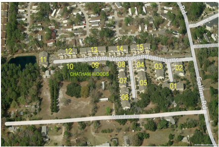
Built in 2005 - 100 units - 2 floors

Chatham Woods Condominium Association, Inc. 5260 Collins Rd, FL 32244 (904) 646-2626