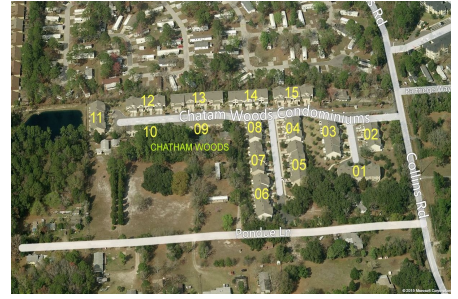
Built in 2005 - 100 units - 2 floors

Chatham Woods Condominium Association, Inc. 5260 Collins Rd, FL 32244 (904) 646-2626