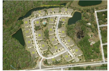
Built in 2006 - 160 units - 2 floors

The Cottages At Greenland Condo Assoc 6620 South Point Drive South # 610 Jacksonville, FL 32256 Phone: (904) 268-5861