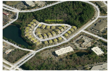
Built in 2005 - 93 units - 2 floors

Deerfoot Point Condominium Association Inc 5455 A1a South South Saint Augustine, FL 32080 Phone: (904) 292-4500 http://deerfootpoint.com/deerfootpoint/home.asp