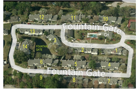
Built in 1984 - 97 units - 2 floors

FOUNTAIN GATE CONDOMINIUM ASSOCIATION, INC. STELLAR PROPERTIES OF NORTH FLORIDA INC 3015 HARTLEY RD JACKSONVILLE FL 32257 PHONE 904-886-1789