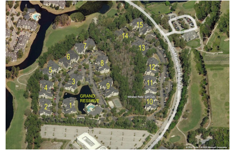
Built in 1997 - 388 units - 3 floors

Grand Reserve At Windsor Parke Ltd 13810 Sutton Park Drive North Jacksonville, FL 32224 Phone: (904) 223-6089