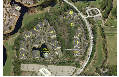
Built in 1997 - 388 units - 3 floors

Grand Reserve At Windsor Parke Ltd 13810 Sutton Park Drive North Jacksonville, FL 32224 Phone: (904) 223-6089