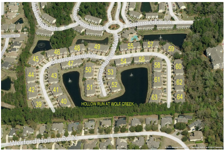
Built in 2005 - 184 units - 2 floors

Wolf Creek Condominium Association Address: 13364 Beach Blvd, Jacksonville, FL 32224 Phone:+1 904-992-6604