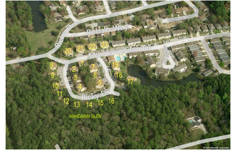
Built in 1985 - 92 units - 2 floors

Mandarin Glen Homeowners Association Address: 7235 Bonneval Rd, Suite 270 Jacksonville, FL 32256 Phone: (904) 220-8009 Fax: (904) 592-2270 http://mandaringlen.com/main.php?IMenuID=2115