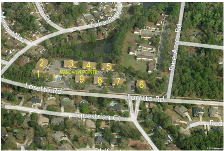
Built in 1986 - 78 units - 2 floors

MANDARIN POINTE CONDOMINIUM ASSOCIATION, INC. LELAND MANAGEMENT INC 10175 FORTUNE PARKWAY STE 906 JACKSONVILLE FL 32256 PHONE 407-447-9955 FAX 407-447-9899