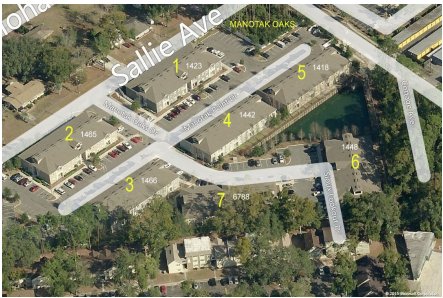
Built in 2006 - 112 units - 2 floors

Manotak Oaks Condominiums 1470 Sallie Avenue Jacksonville, FL 32210 Phone: (904) 783-2816