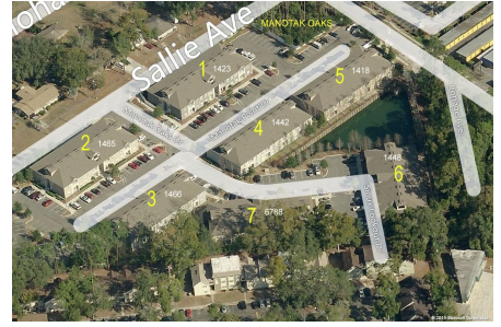
Built in 2006 - 112 units - 2 floors

Manotak Oaks Condominiums 1470 Sallie Avenue Jacksonville, FL 32210 Phone: (904) 783-2816