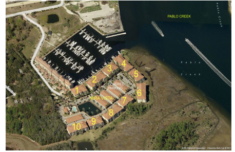
Built in 2005 - 150 units - 3 floors

Mira Vista Condominium Association 13846 Atlantic Blvd. #211 Jacksonville, FL 32225 http://miravistacondos.org/miravista/home.asp