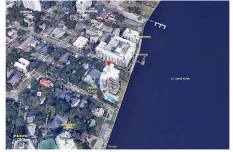
Built in 1984 - 44 units - 16 floors

Number of units: 44 Number of active listings for rent: 0 Number of active listings for sale: 0 Building inventory for sale: Number of sales over the last 12 months: 0% Number of sales over the last 6 months: 1 Number of sales over the last 3 months: 1