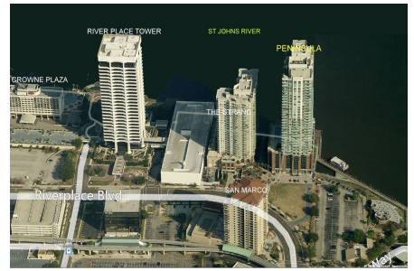
Built in 2008 - 234 units - 37 floors

Peninsula At St John Center 1431 Riverplace Blvd, Jacksonville, FL 32207 (904) 346-1946