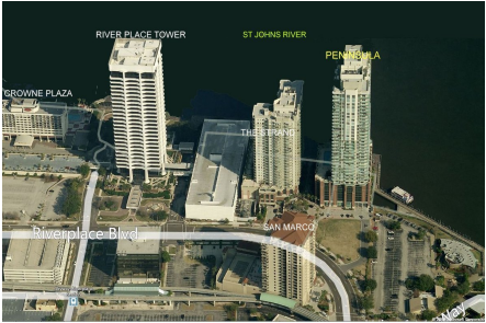
Built in 2008 - 234 units - 37 floors

Peninsula At St John Center 1431 Riverplace Blvd, Jacksonville, FL 32207 (904) 346-1946