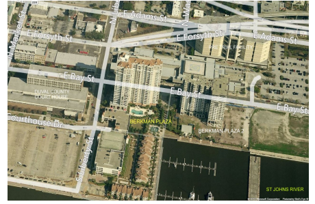
Built in 2003 - 206 units - 21 floors

Plaza Condominium Association-Berkman Address: 400 E Bay St, Jacksonville, FL 32202 Phone:+1 904-359-5938 http://www.theplaza1.com/