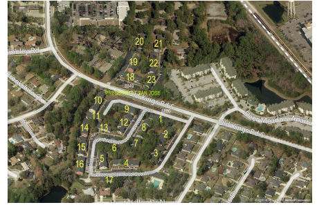
Built in 1974 - 196 units - 2 floors