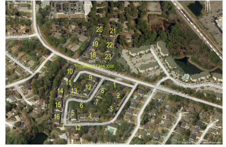
Built in 1974 - 196 units - 2 floors

Preserve At San Jose Address: 8880 Old Kings Rd S, Jacksonville, FL 32257 Phone: +1 904-731-1200 http://www.thepreserveatsanjose.org/