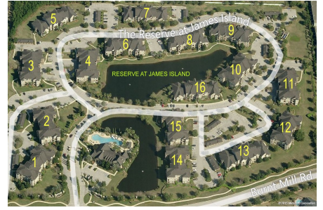
Built in 2001 - 354 units - 3 floors

Reserve At James Island Condos Office 10961 Burnt Mill Rd, Jacksonville, FL 32256 (904) 565-6016 http://reserveji.com/outside_home.asp