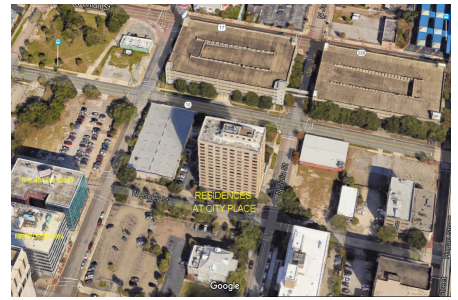
Built in 1949 - 205 units - 17 floors

Residences at City Place 311 West Ashley Street Jacksonville, FL 32202 Phone: (904) 358-2489 Fax: (888) 847-8438 http://www.cityplacejacksonville.com/