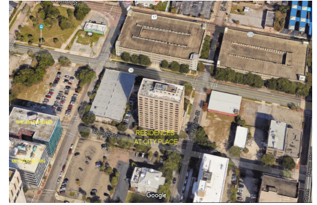
Built in 1949 - 205 units - 17 floors

Residences at City Place 311 West Ashley Street Jacksonville, FL 32202 Phone: (904) 358-2489 Fax: (888) 847-8438 http://www.cityplacejacksonville.com/