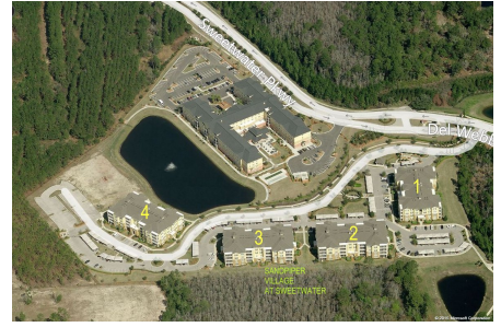
Built in 2006 - 128 units - 4 floors

Sandpiper Condominium 9831 Del Webb Pkwy, Jacksonville, FL 32256 (904) 519-8981