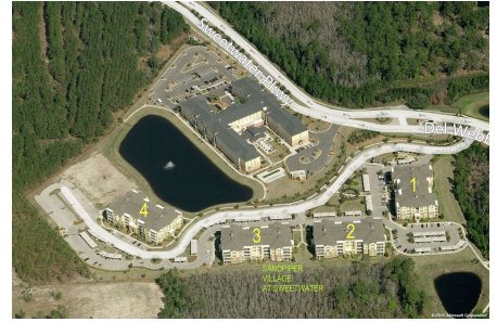
Built in 2006 - 128 units - 4 floors

Sandpiper Condominium 9831 Del Webb Pkwy, Jacksonville, FL 32256 (904) 519-8981