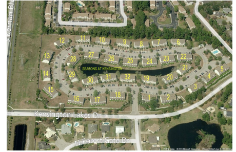
Built in 1998 - 192 units - 2 floors

KENSINGTON ASSOCIATION, INC. BCM SERVICES, INC. PO BOX 161088 JACKSONVILLE FL 32266 PHONE 907-242-0666 FAX 907-242-0670 http://www.kensingtonassociation.com/kensingtonassociation/page.html