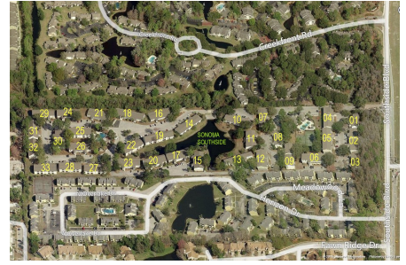
Built in 1986 - 264 units - 2 floors

Sonoma Southside 7740 Southside Blvd, Jacksonville, FL 32256. (904) 646-1000 http://www.psdm-sonoma.com/