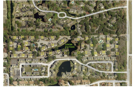
Built in 1986 - 264 units - 2 floors

Sonoma Southside 7740 Southside Blvd, Jacksonville, FL 32256. (904) 646-1000 http://www.psdm-sonoma.com/