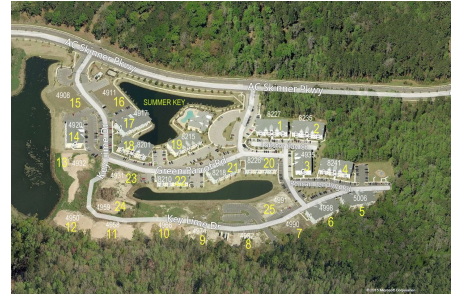
Built in 2007 - 312 units - 3 floors

SUMMER KEY CONDOMINIUM ASSOCIATION INC. RIZZETTA & COMPANY INC PHONE 813-933-5571 FAX 813-935-6212