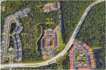
Built in 2007 - 379 units - 4 floors

Villa Medici Condo Assoc Inc Address: 8539 Gate Pkwy W, Jacksonville, FL 32216 Phone:+1 904-296-2216