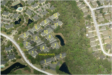
Built in 2001 - 112 units - 2 floors

WINDSOR POINTE CONDOMINIUM ASSOCIATION, INC. SENTRY MANAGEMENT INC 2180 W STATE SR 434 STE 5000 ATTN HR LONGWOOD FL 32779