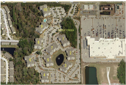
Built in 2006 - 400 units - 4 floors

Wolf Creek Condominium Association Address: 13364 Beach Blvd, Jacksonville, FL 32224, Phone:+1 904-992-6604