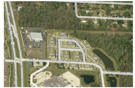
Built in 2007 - 160 units - 2 floors

Woods Of Ortega Condominium Association Inc 5455 A1a South Saint Augustine, FL 32080 Phone: (904) 584-1160