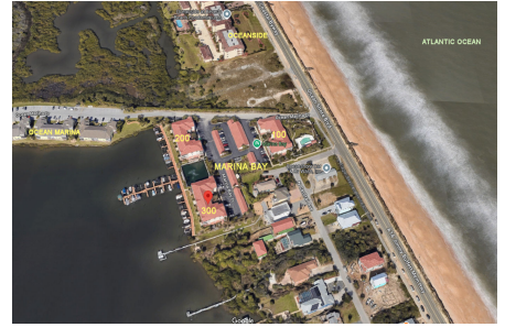
Built in 2000 - 54 units - 3 floors

Number of units: 54 Number of active listings for rent: 1 Number of active listings for sale: 7 Building inventory for sale: 12% Number of sales over the last 12 months: 1 Number of sales over the last 6 months: 0 Number of sales over the last 3 months: 0 Marina Bay 100 Marina Bay Dr Flagler Beach, FL32136