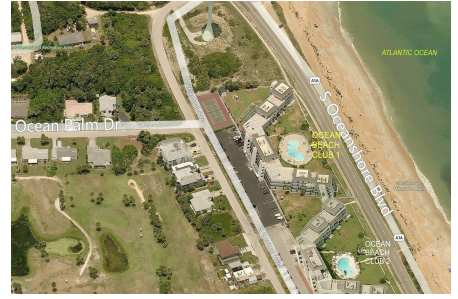
Built in 1976 - 42 units - 4 floors

Ocean Beach Club One 3500 S. Oceanshore Blvd. Flagler Beach FL 32136 On site Superintendent 912-604-9005 http://www.oceanbeachclubone.com/