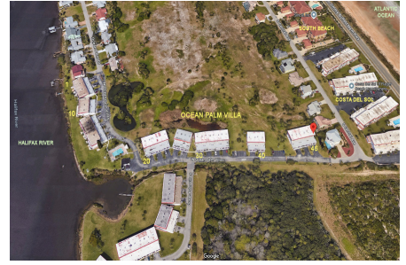
Built in 1979 - 46 units - 2 floors