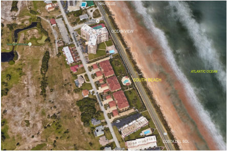
Built in 2001 - 42 units - 3 floors