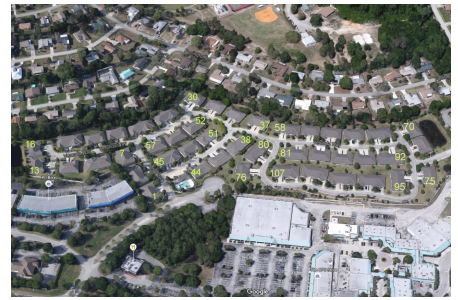
Built in 2002 - 107 units - 1 floor